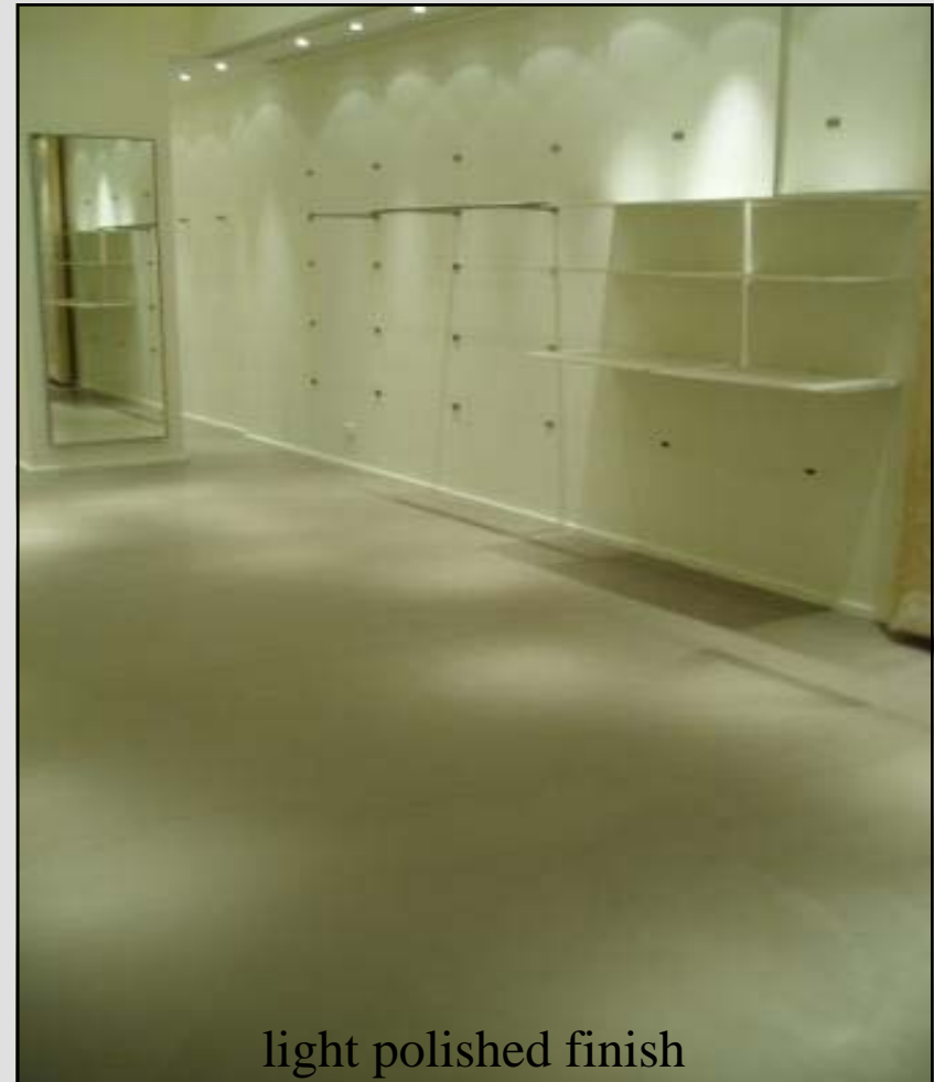
light polished finish

and for expert advice call Kelvin Shaw's All About Floors.