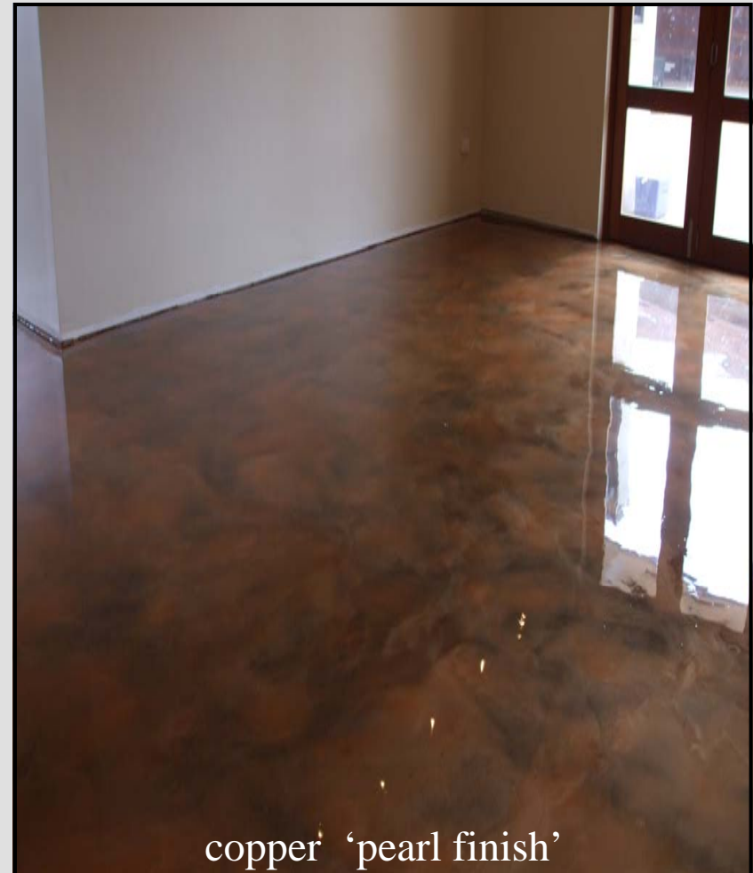
copper 'pearl finish'

In finishes of polished, marble, transparent and pearl.