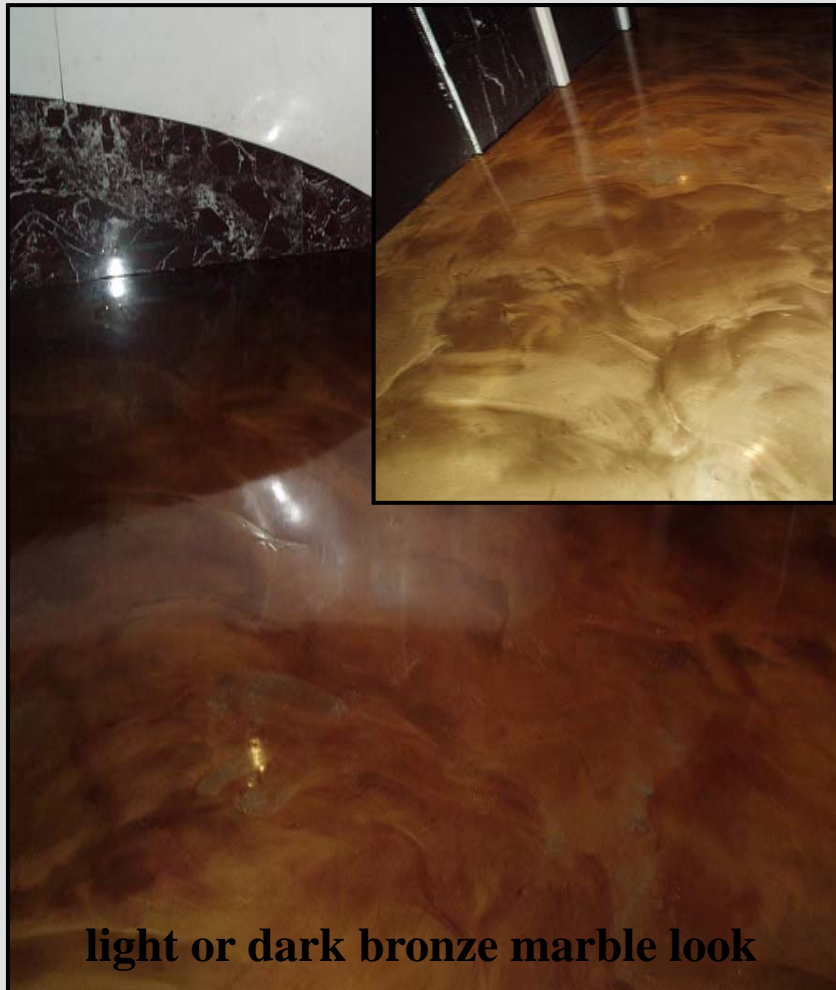
light or dark bronze marble look