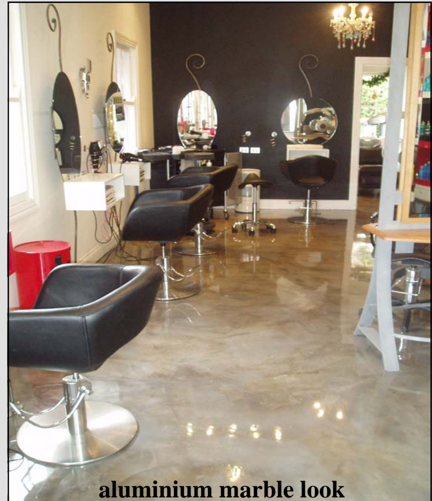
aluminium marble look

Our seamless floors meet Australian standards for slip resistance - R9 to R13