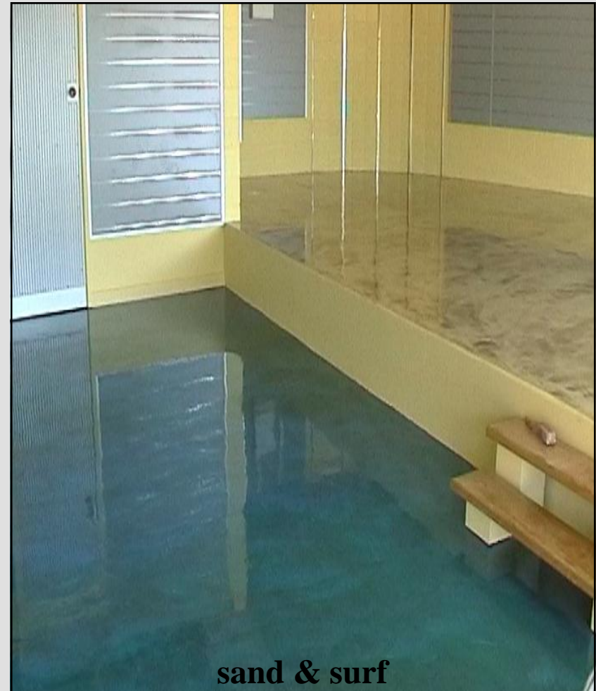
sand & surf

The versatility of our products in colour, design and application are the reasons why our floors stand out from the rest.