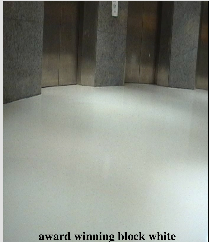
award winning block white

our motto is 'You design it, we create it'