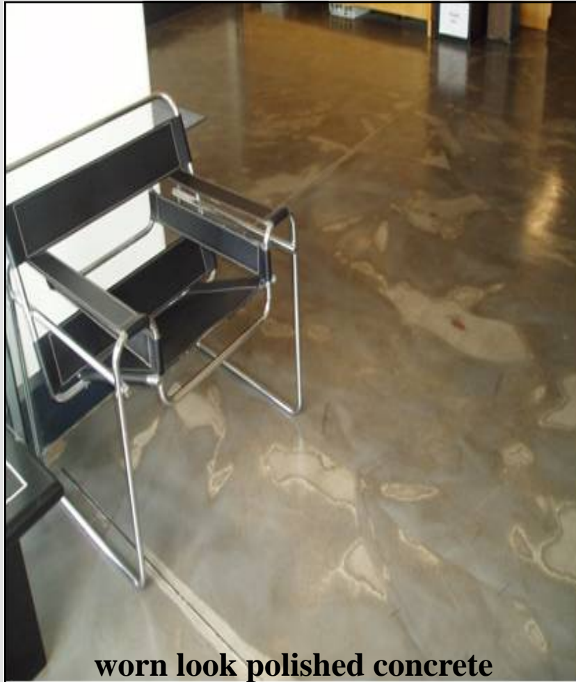
worn look polished concrete

All About Floors can specify and apply all types of concrete coatings including designer, epoxy self-levelling floors, seamless floor finishes, polished concrete, concrete protection and waterproofing.