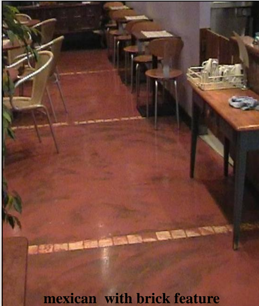
mexican with brick feature

The versatility of our products in colour, design and application are the reasons why our floors stand out from the rest.