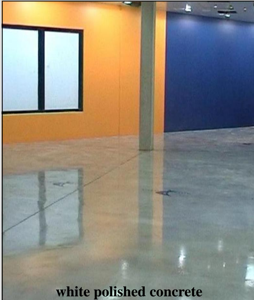
white polished concrete

Floors in industrial areas have to endure a lot of punishment. Epoxy roll coat floors are hardwearing and are extremely resistant to food stains, fuel, grease, tyre marking, and can withstand heavy foot traffic. Ideally suited for factories, warehouses and workshops.