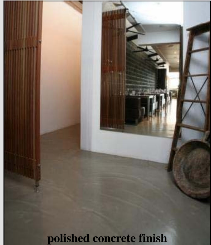
polished concrete finish

From 50 to 20,000 sqm, our commercial floors can be designed to suit whatever location you have.