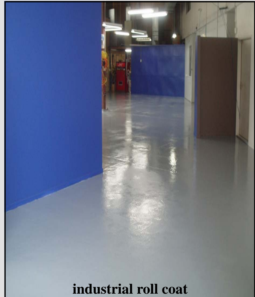
industrial roll coat

All About Floors can estimate and specify all Commercial, Industrial & Domestic projects within Australia.