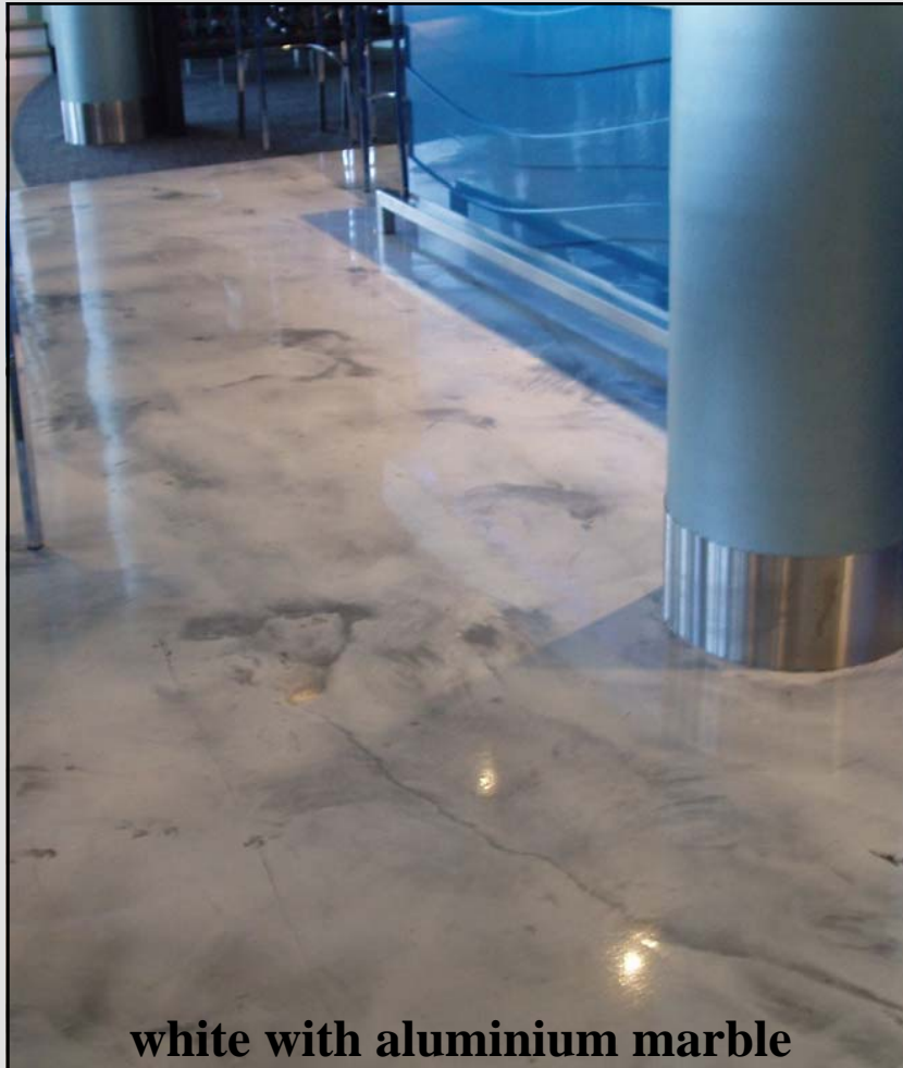
white with aluminium marble

So we encourage you to use your imagination or ours to design a floor to suit your specifications.