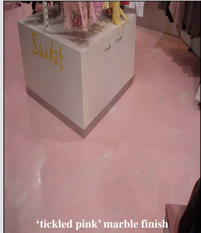
'tickled pink' marble finish

We provide concrete coating floors for showrooms, restaurants, retail space, warehouses.